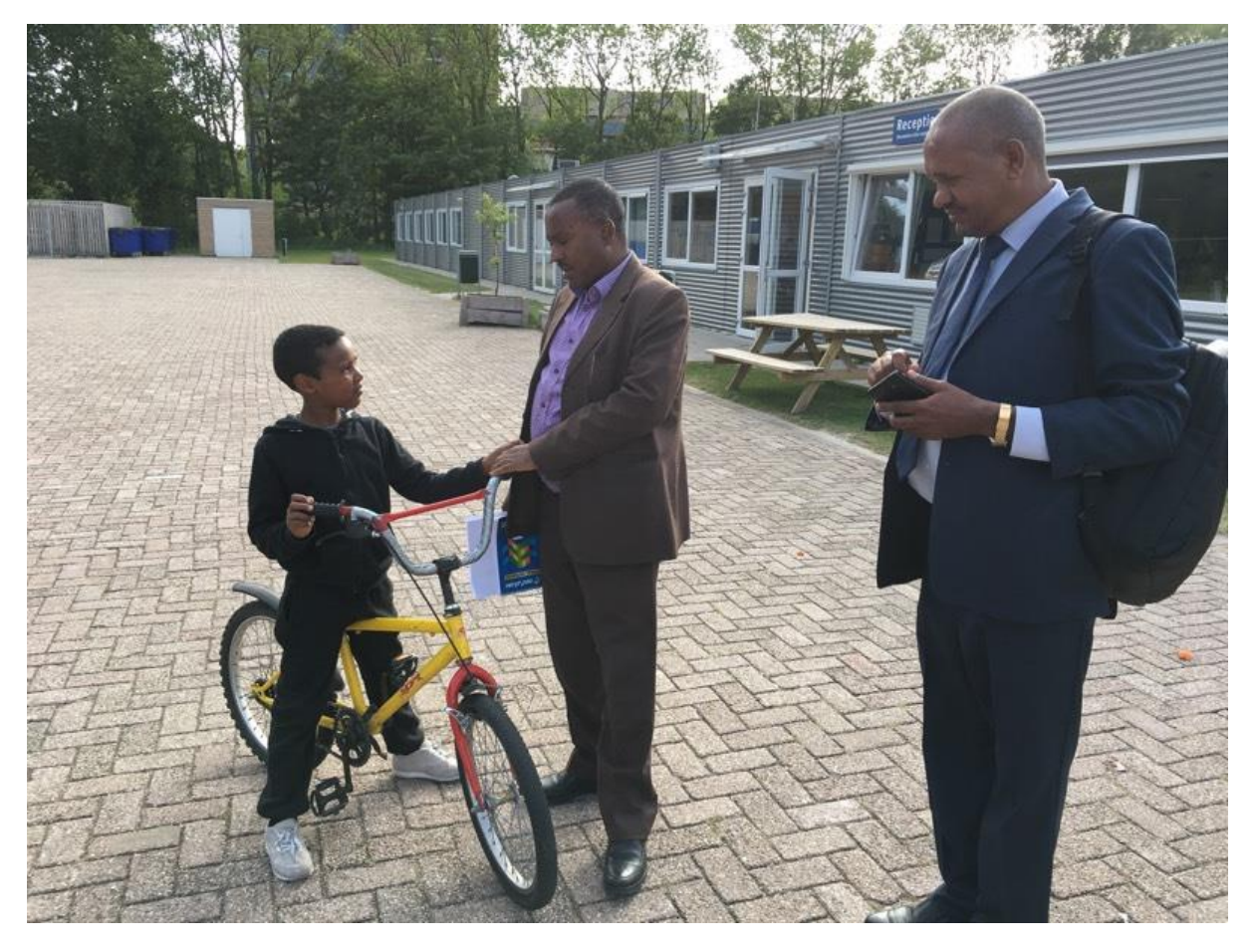
Visit of the Ethiopia delegation to a reception centre in Rijswijk during the visit to COA, 17 May

Presentation 16 May – Prosecutor and the Federal General Attorney at KPSRL