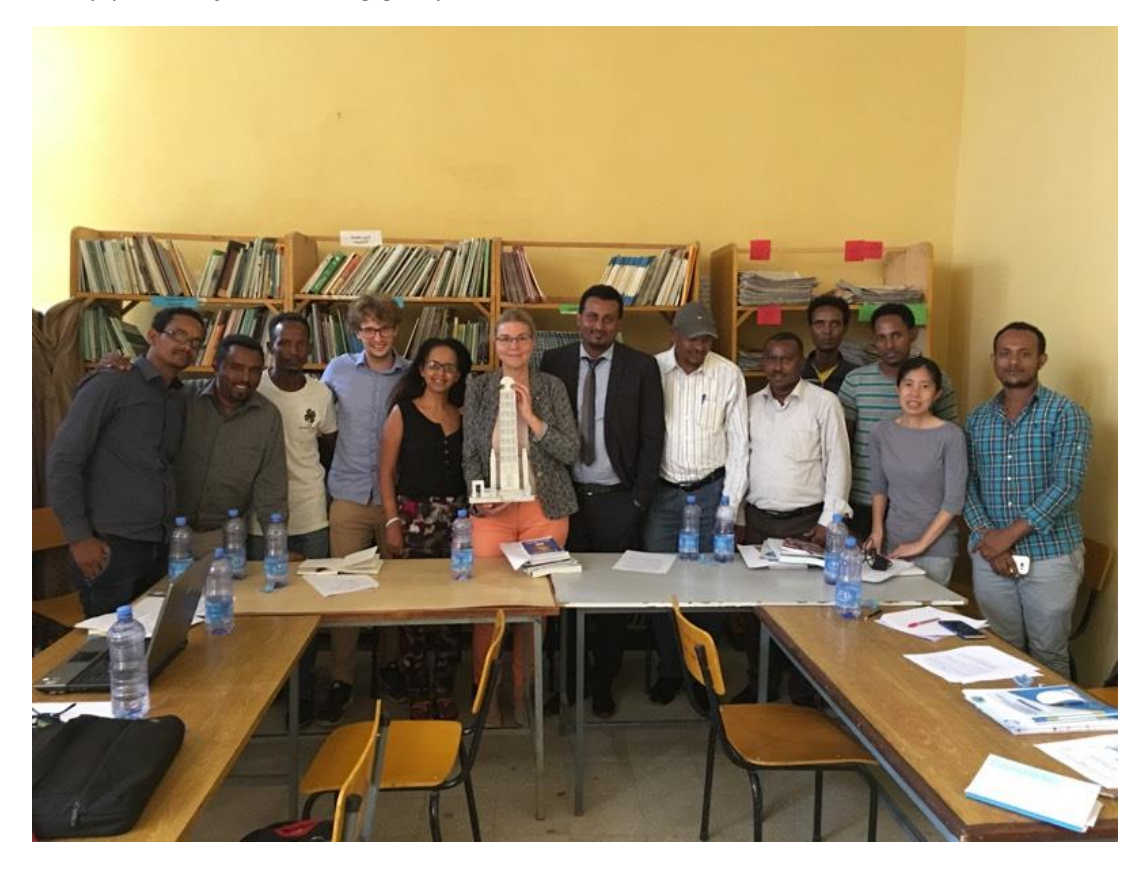
Representative of Shemelba refugees