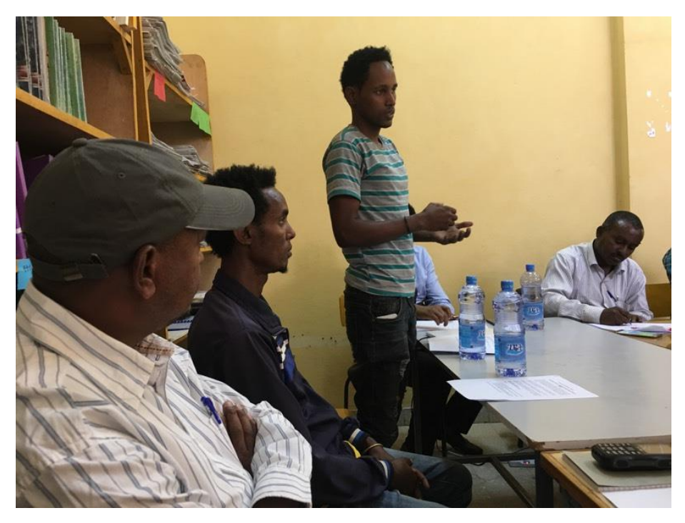
Local NGO representative