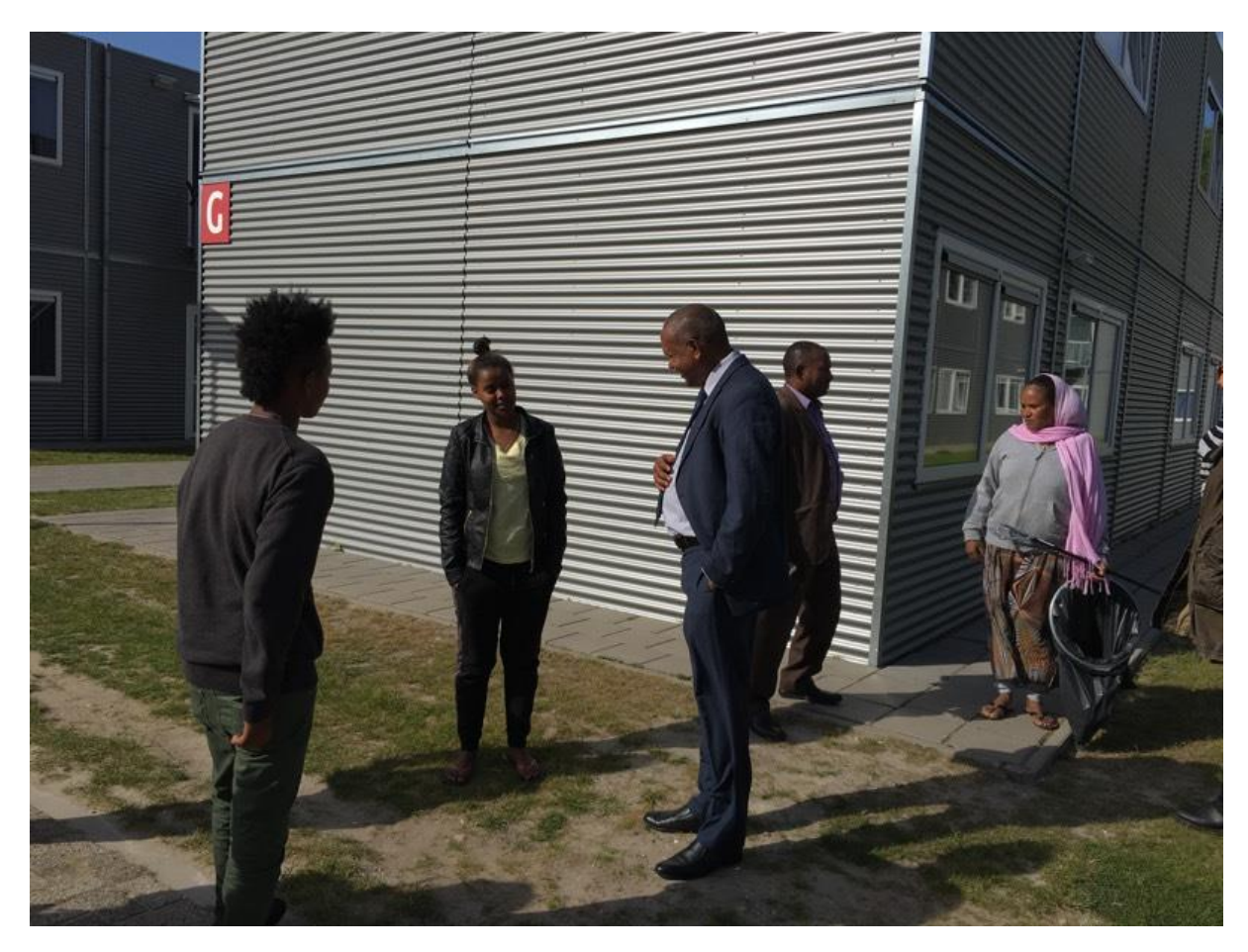
Ethiopia delegation with the COA employees after the meeting