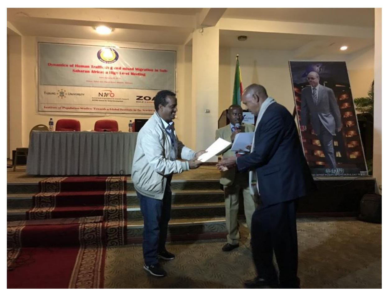
Representative of ARRA, Director in Shire, participant in the meeting