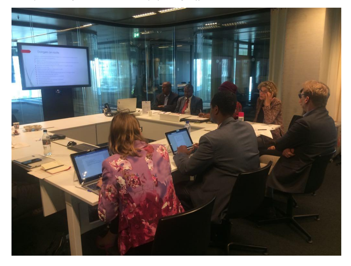
14 May – Meeting at the Dutch Ministry of Foreign Affairs