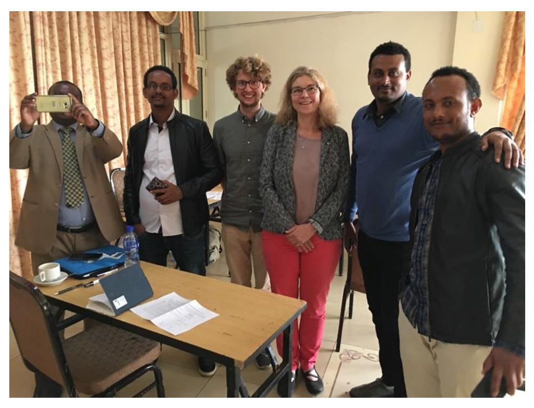
20 July 2017 – Field visits Ethiopia, meetings ZOA, UNHCR, NCR

Preparation of field work with translators