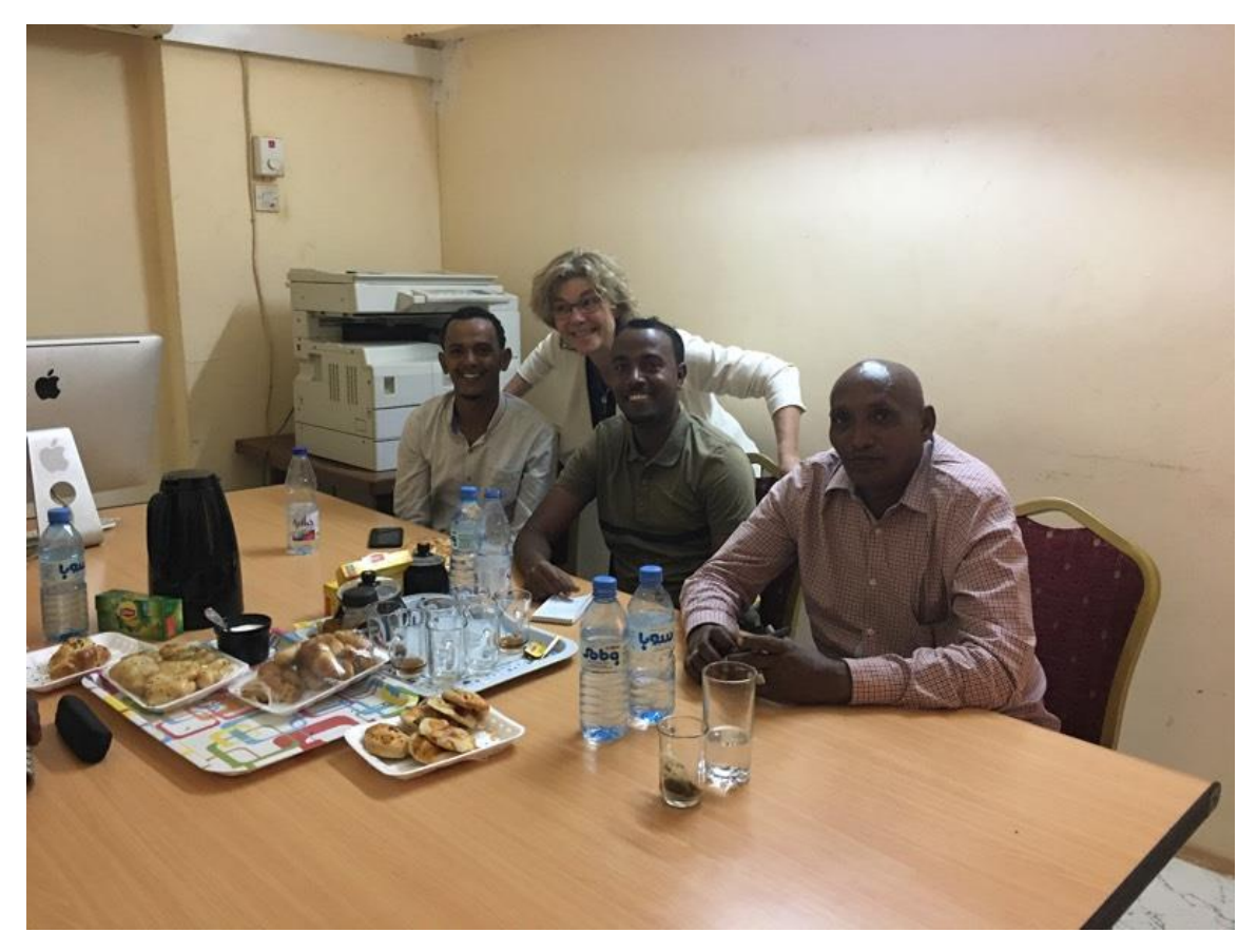
Meeting UNHCR representative Kassala