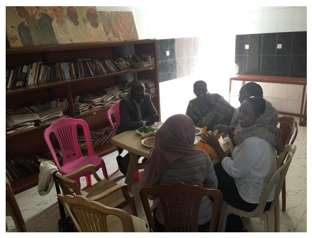
Meeting with University of Khartoum

Dissemination meeting at SORD with Eritrean refugees