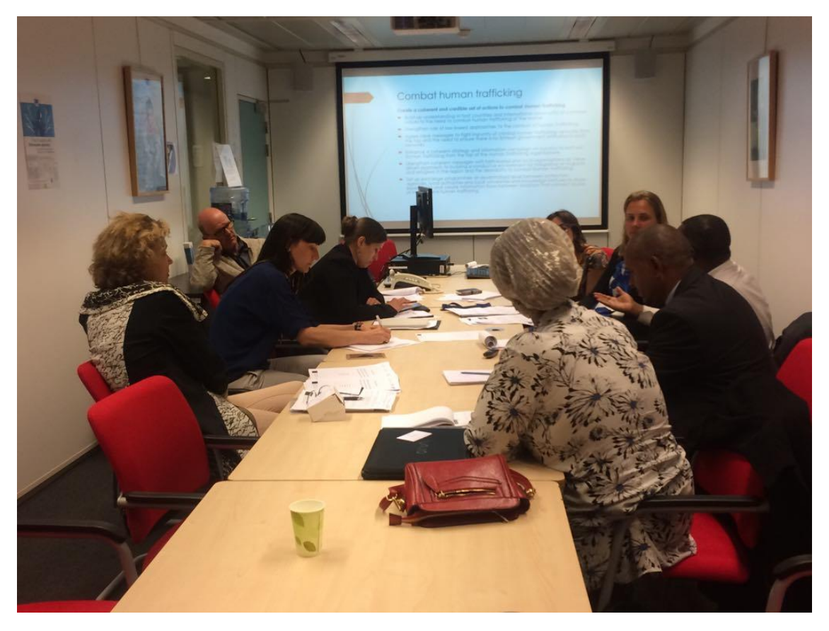
16 May, Presentation by ARRA at meeting at the KPSRL platform with experts and Foreign Affairs representatives

15 May - Meeting at the European Commission with DG ECHO, DG DEVCO and EEAS representatives