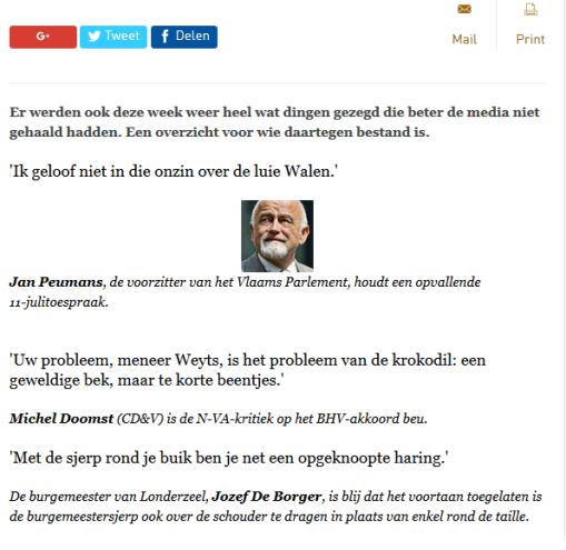
Figure 1: The first part of the 13 July 2012 installment of the Ongehoord feature on De Standaard's news site ( http://www.standaard.be/cnt/dmf20120712_137 )

In most cases, the original context in which the quotes appeared, is edited out. Each episode of Ongehoord can be seen as a narrating event that embeds a number of narrated events (Wortham & Locher 1996): a reanimated news quote from a public figure and a journalistic response (Fig. 2).