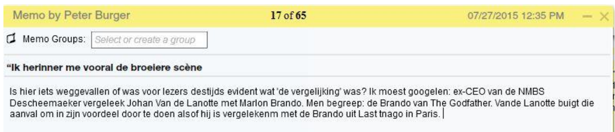
Figure 4. Memo 2:

‘I remember in particular the racier scenes from Last Tango in Paris.’