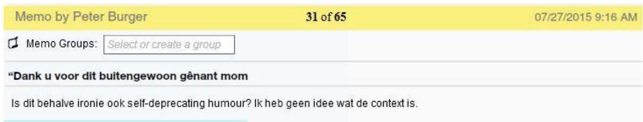
Figure 3: Memo 1: ‘This is irony, but is it also self-deprecating humor? I have no clue about its context.’

Understanding the metadiscursive references proved challenging. Although one of us (Van Hout) is Flemish and we are both native speakers of Dutch, we frequently had to search the Internet to understand particular text bites. Nor did we agree in each instance on how to read the editors' positive comments: as praise, or as irony. Text bites featuring explicit praise or blame proved to be the outliers: we coded no more than five items as containing explicit praise, and ten as containing explicit blame. To illustrate the problems posed by the text bites' density, we present two memos from our Dedoose coding files.