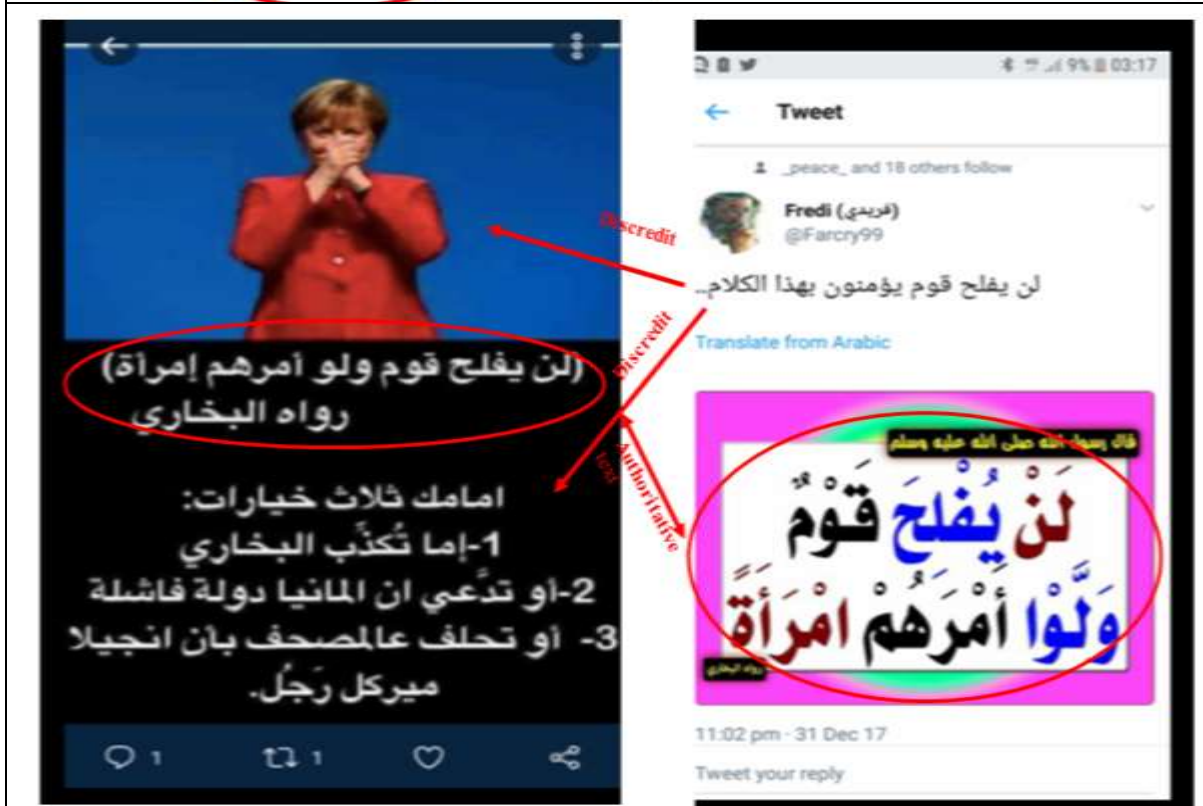
Mediated action 6: The structure of discredits