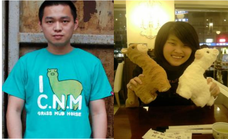
Figure 7: caonima T-shirt and toys

of struggles extends even beyond the Internet, as the image of caonima goes offline, enters people's everyday life and is turned into consumable goods and identity statements in popular culture (see Figure 7).