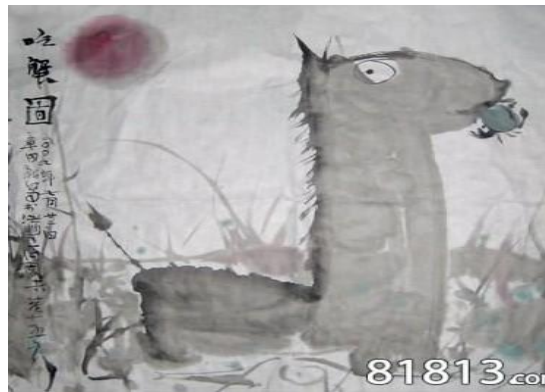
Figure 6: ‘grass mud horse’ swallowing ‘river crab’

In the beginning, the invention of ‘grass mud horse’ became popularized among the Chinese netizens only as a clever euphemism of a swearing word that can escape the touch of harmonization. But gradually, caonima took on a whole new life beyond this function. A mythical animal depicted as a furry, amiable-looking alpaca was created to give a physical embodiment of caonima , a previously nonexistent creature, and started roaming on the Internet. Then, a story was invented about the grass mud horse, which tells that the magical beast lives in a desert ‘Mahler Gobi’ ( malegebi 马勒戈壁) and feeds on ‘fertile grass’ ( wocao 沃草). Although the environment in Mahler Gobi desert is extremely harsh, the grass mud horse lives a happy life there. But one day, the river crab moves into Mahler Gobi. The grass mud horse and the river crab have a fierce fight and, finally, the grass mud horse wins the battle (see Figure 6) and goes on living in the fantasy land of Mahler Gobi desert thereafter.