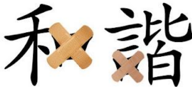
Figure 3: ‘harmony’ with no ‘mouth’

While the state doctrine of hexie shehui is used as a mandate to justify the tight control of communication and the quashing of potentially ‘disharmonious’ speech online, the word hexie has become over the years a satirical placeholder for ensuring stability and political status quo at all costs. The Chinese netizens started to use the word hexie as a euphemism for Internet censorship. When netizens say that a user has been ‘harmonized’, the suggestion is that the person has somehow been brought into compliance by government agency, whether by physical force or by losing access to his/her account. Through the appropriation of this word, they in fact voice criticism of governmental claims that censorship is employed to maintain a harmonious society. This attitude is illustrated in a widely circulated picture online (see Figure 3), which shows the word 和諧 (harmony) in traditional characters with the radical 口 (meaning ‘mouth’) in both characters being covered with plasters. Through this image, grassroots netizens argue that harmonization is in fact a policing strategy adopted by the authorities to silence their voices, to muzzle them.