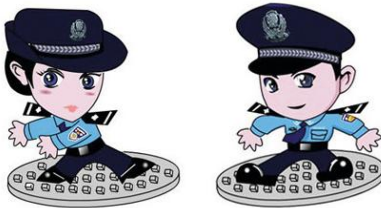
INTERNET POLICE: Meet JingJing and Chacha, the friendly faces of Chinese state censorship who pop up regularly to remind people of the rules

1999 regarding the management of Internet Protocol address in order to accurately track the activities of individual end users online. The panoptic surveillance is conjointly carried out by the online police (see Figure 2) who inspect and enforce judicial punishment against disharmonious behaviors. The presence of law enforcement and policing online, of course, had started much earlier, in 2003 when the Ministry of Public Security put in operation the massive Golden Shield censorship project, known to many as the Great Firewall of China.