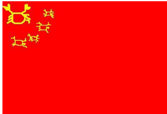
Figure 4: hexie (river crab) on the national flag

The parodist appropriation of ‘harmony’ has, ironically, turned the word itself into a so-called sensitive word, namely, an object of policing. When the word hexie begot censored and ‘harmonized’ online, Chinese netizens creatively adopted the word ‘river crab’ (河蟹) to replace the direct use of ‘harmony’ since the two words are homophones that are only tonologically different: héxié for ‘harmony’ and héxiè for ‘river crab’. Images of river crabs (see e.g. Figure 4) are also circulated online to imply discontent with the state censorship and suppression of freedom of speech. In fact, ‘river crab’ has gradually become an Internet buzzword or meme that symbolizes, euphemistically, the ideological battling between ‘harmonization’ and ‘counter-harmonization’ in the Chinese cyberspace.