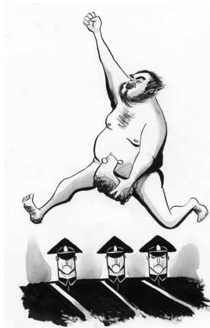
Figure 8: Ai Weiwei with caonima

symbol of ridicule and contempt over the control of online communication imposed from the above (as depicted in a cartoon impression of Ai Weiwei's act of art by the Chicago artist Tom Tian, see Figure 8).